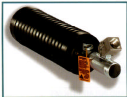
Conversion Kit - Muni-Ball® to Remo® Plug